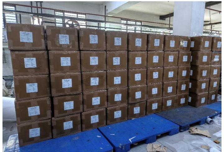
Inspected products are ready for shipment

As an Indian supplier serving international markets, maintaining consistent product quality is paramount particularly for shipments to Germany, where regulatory requirements and quality expectations are exceptionally rigorous. With over 25 years of experience in quality