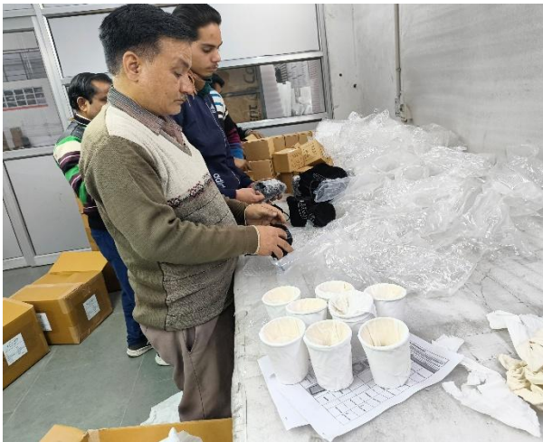
Unpacking of finished products prior to quality inspection