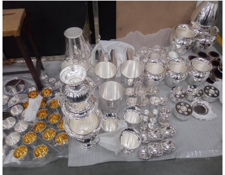
Products laid out for verification prior to shipment.