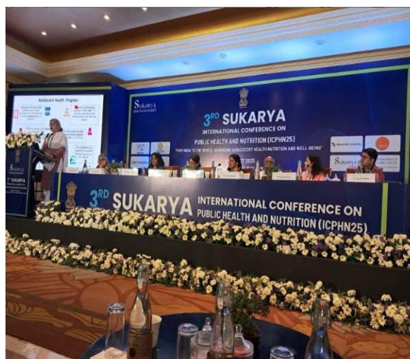
The panelists at the 3 rd Sukarya International Conference held at ITC Maurya

IGEP was proud to be a sponsor of the 3rd Sukarya International Conference on Public Health and Nutrition , held on 14–15 October at ITC Maurya, New Delhi , in collaboration with the Rotary Club of Delhi Midtown (District 3011) . This partnership builds on the long-standing association between IGEP, Rotary Midtown and Sukarya, who have worked together on impactful community initiatives such as the Education of Wheels and other public education and health interventions.